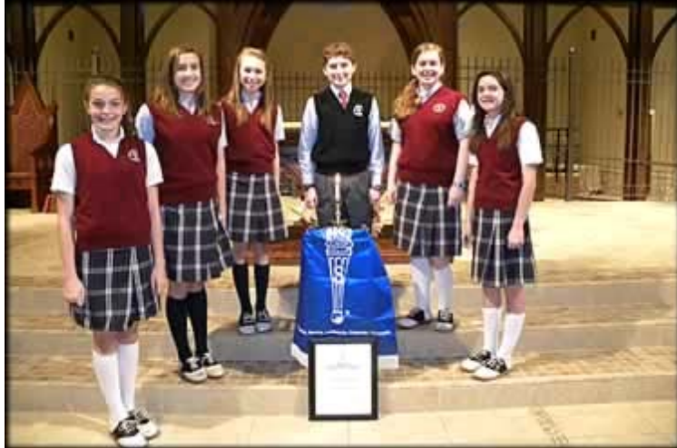
National Junior Honor Society Inductions