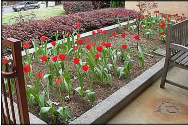
Planting Our Promise