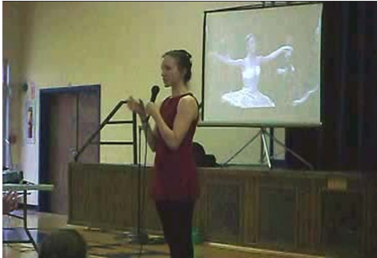
Cultural Arts Dance Presentation