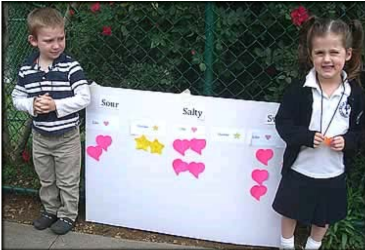
Pre-K students show off their "taste graph," which was part of PK Sense Science Day.