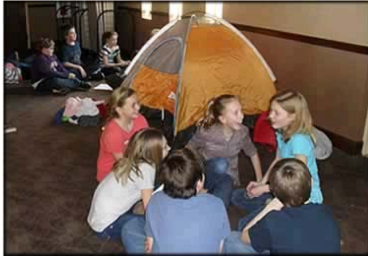
Sixth Grade Retreat