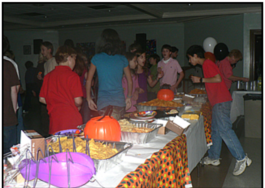
MIDDLE SCHOOL DANCE: After a vote, students chose to keep the middle school dances during the school day. Look for more dance photos in next week's Buzz .