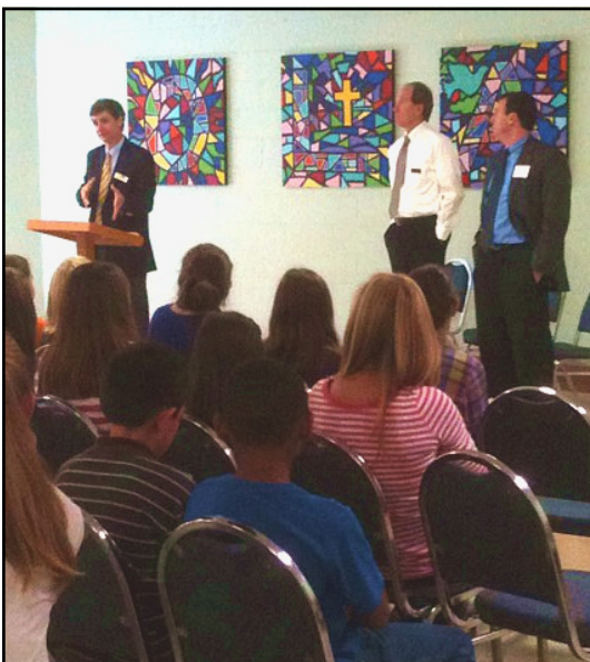
HIGH SCHOOL INFORMATION SESSION: Middle School students and their parents listen to presentations from the Admissions Directors of the three local Catholic high schools.

November 05 November 19 December 03 December 10 January 07, 2011 January 21 February 04 February 25 March 11 March 25 April 18-20 (Holy Week) May 06